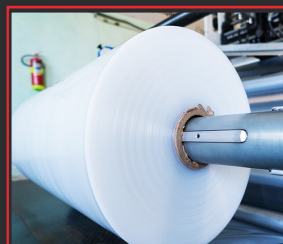
STANDARD PALLET COVER