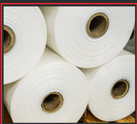
GUSSETED HEAT SHRINK TUBING