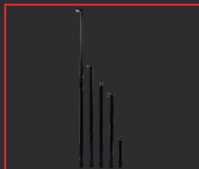
RIPACK SHRINK GUN EXTENSION POLES