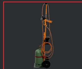
GAS BOTTLE TROLLEY